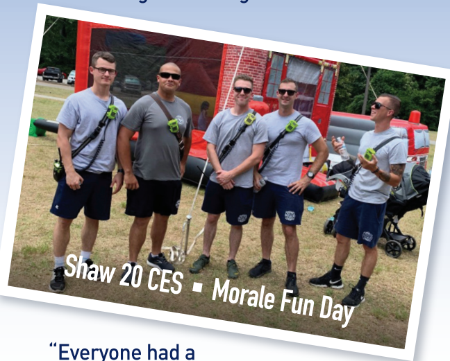
Shaw 20 CES ■ Morale Fun Day

"Unite funds went a long way toward making sure no one was excluded from this event."