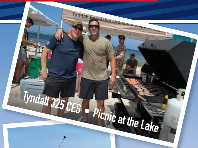
Tyndall 325 CES ■ Picnic at the Lake

"We were able to team strategize get rid of stress and have lots of fun doing something different."