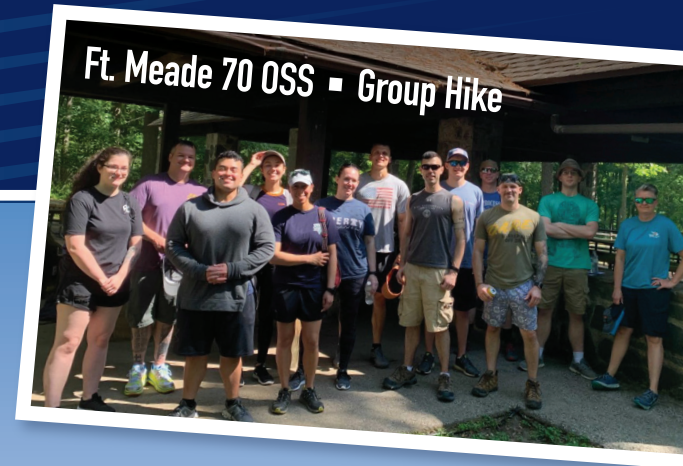
Ft. Meade 70 OSS ■ Group Hike

"Unite funds went a long way toward making sure no one was excluded from this event."