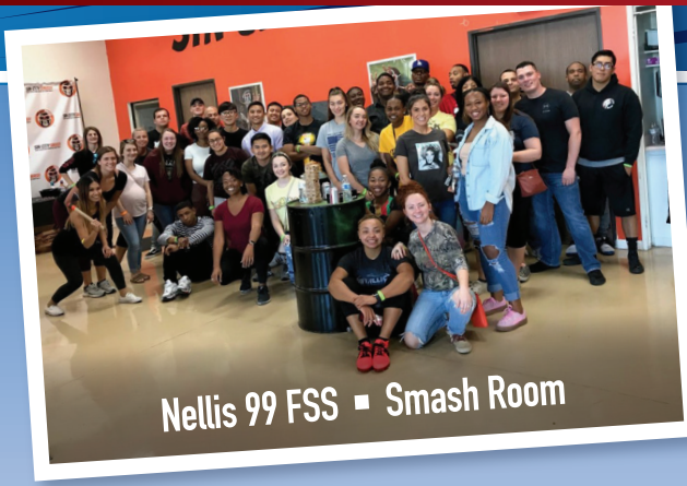
Nellis 99 FSS ■ Smash Room

builds morale, encourages teamwork develops communication & so much more!