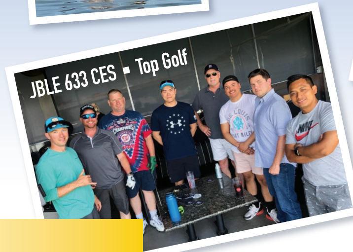
JBLE 633 CES ■ Top Golf