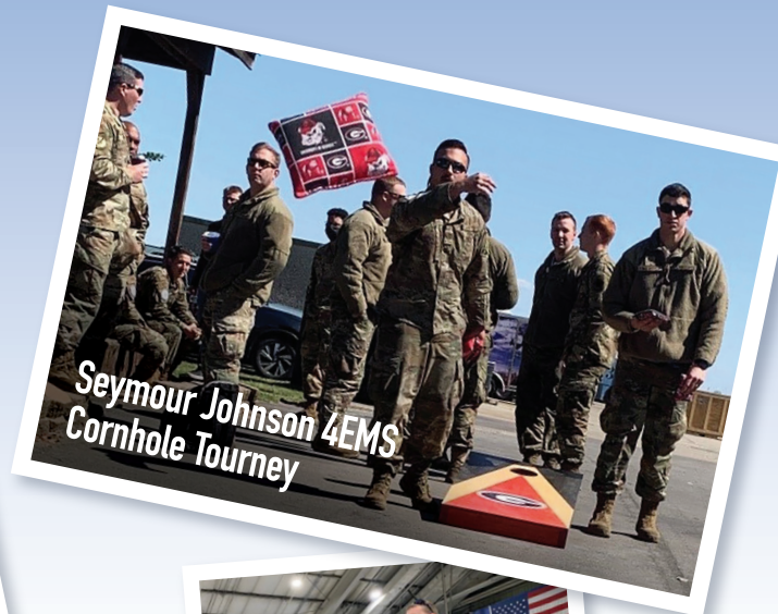
Seymour Johnson 4EMS Cornhole Tourney